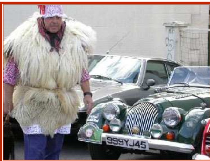
Giant shepherd from the parade – Probably too big to get into Jims' 4/4

Of course, as often, the met man had got it wrong, and we arrived in Bordeaux with dirty wires which we had to clean hastily, because the car was included in the village fête, parading in the village and carrying models for a show.