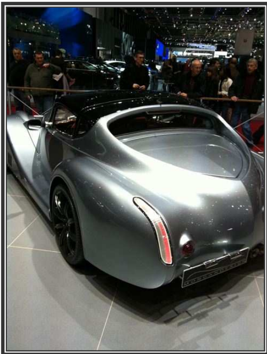
The new Aero

Lawrence has also supplied photos of the new Aero for those that prefer more modern luxuries.