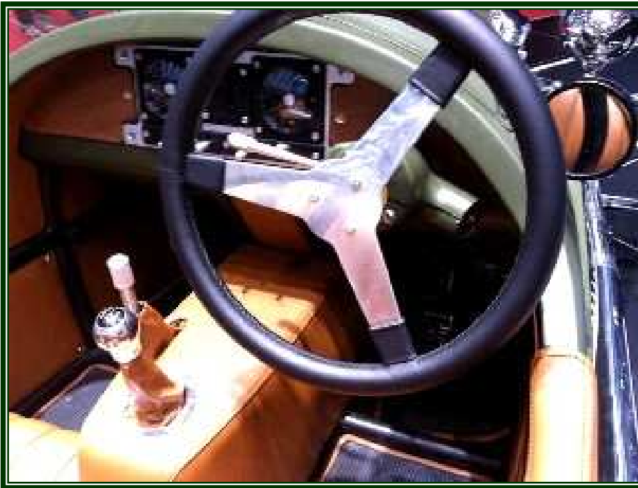
Steering Wheel and controls of the 3-wheeler

Price The new 3-wheeler Morgan is available for sale at 54,000 Swiss Francs = US$54,000 (which, currently, also also equates to the same money in Australian dollars).