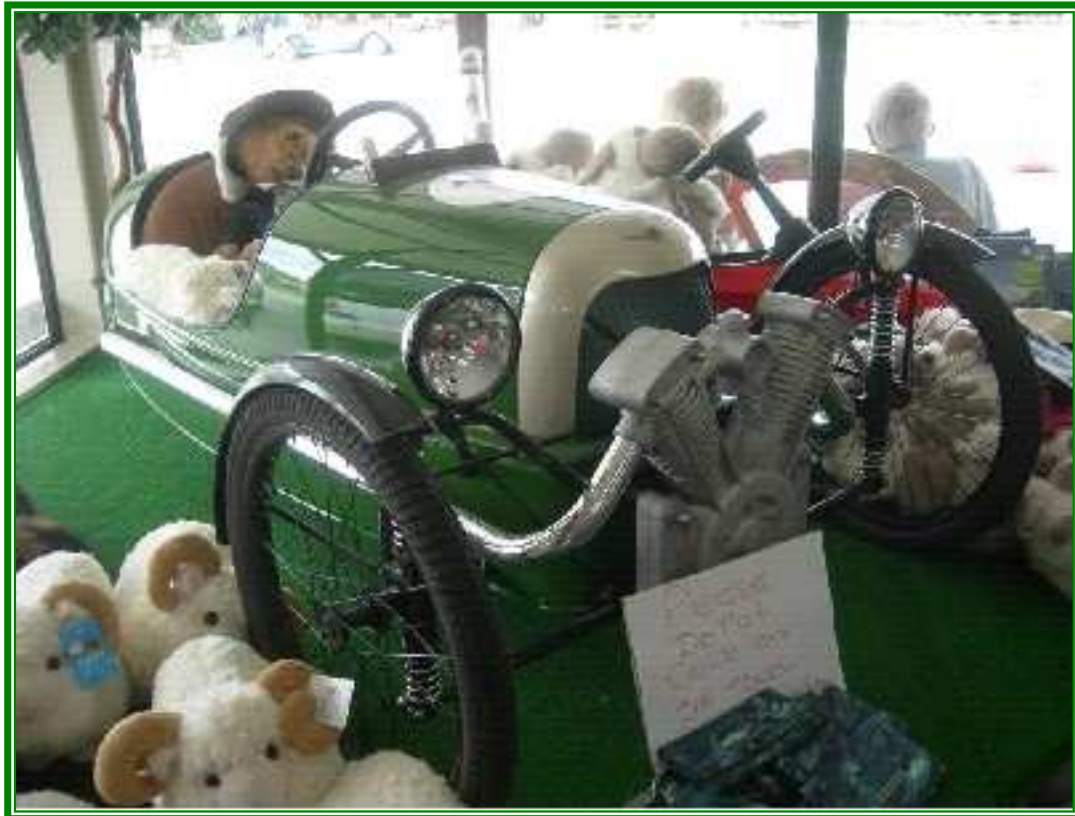
The teddy's are in a 3-wheeler in the middle of no where (South Island, NZ) with a very exclusive Harrods MOG in a window.

He also owns the very last 2010 Aero (below)