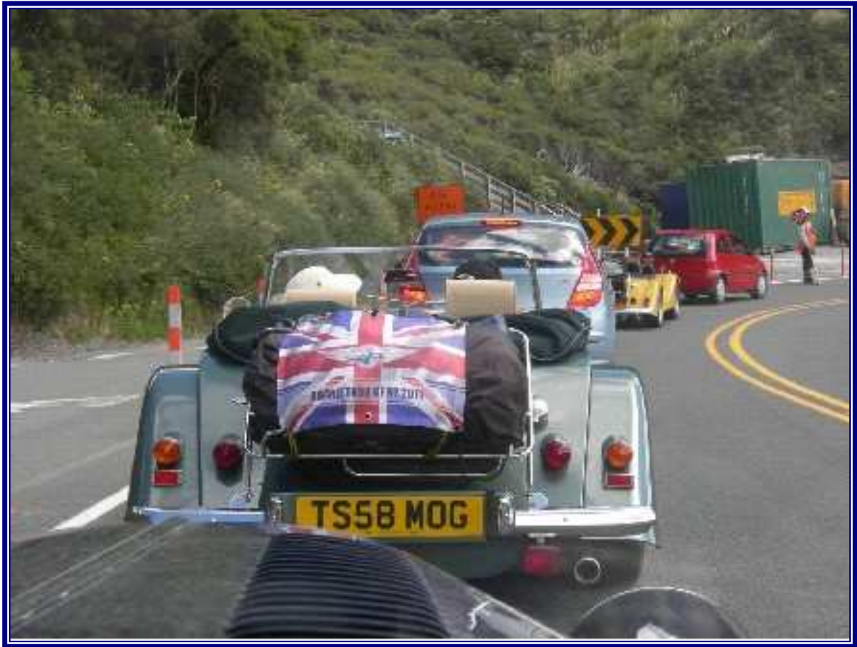
UK Mog in NZ – the view from BlueMog