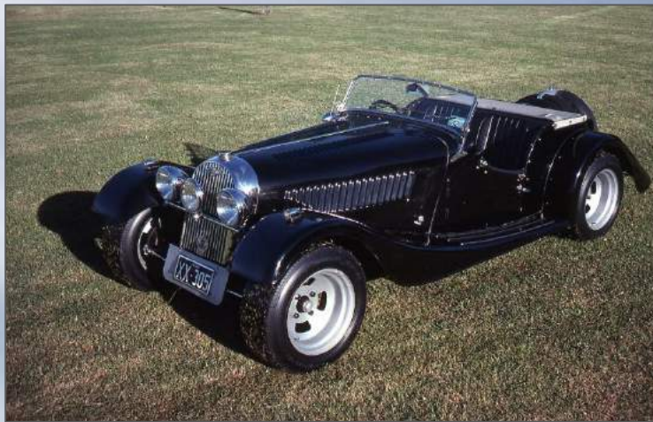
The beast at rest!