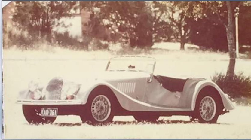
In Brisbane at last, early 1975.