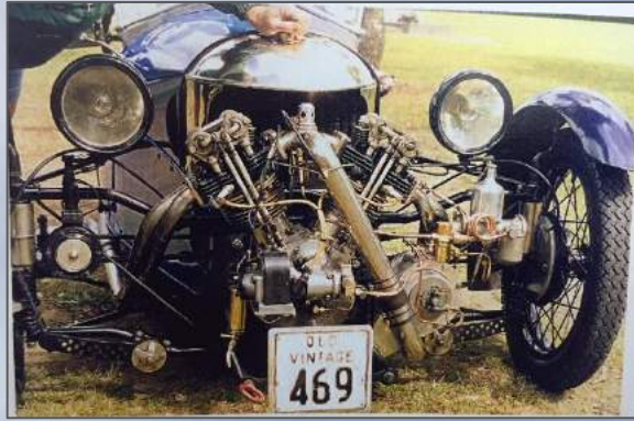
The 1098cc Anzani engine with supercharger at the 2002 Bathurst Morgan Muster.