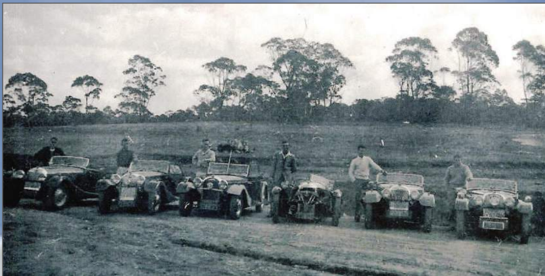
An early MOCA run with our member and his 4/4 being second from the left.