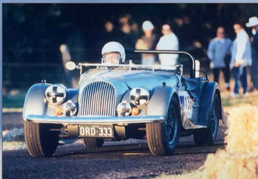
Competing in the Leyburn Sprints – mid 1990s.