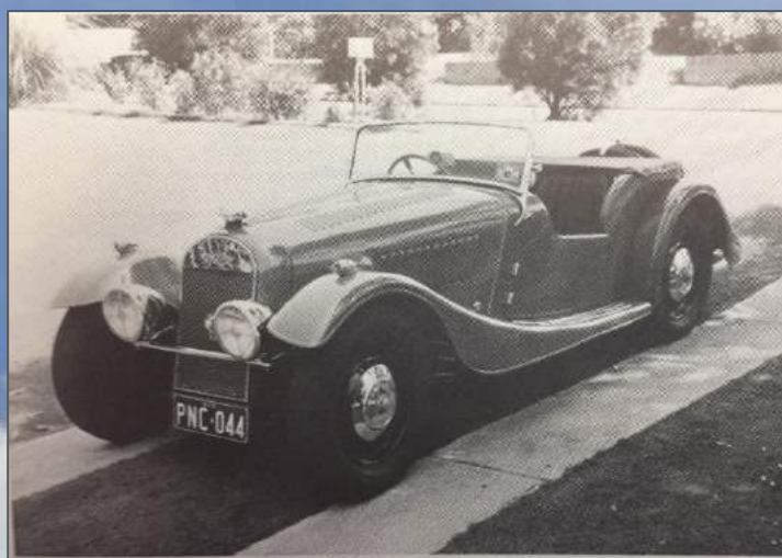
First Morgan restoration – a 1936 4/4.