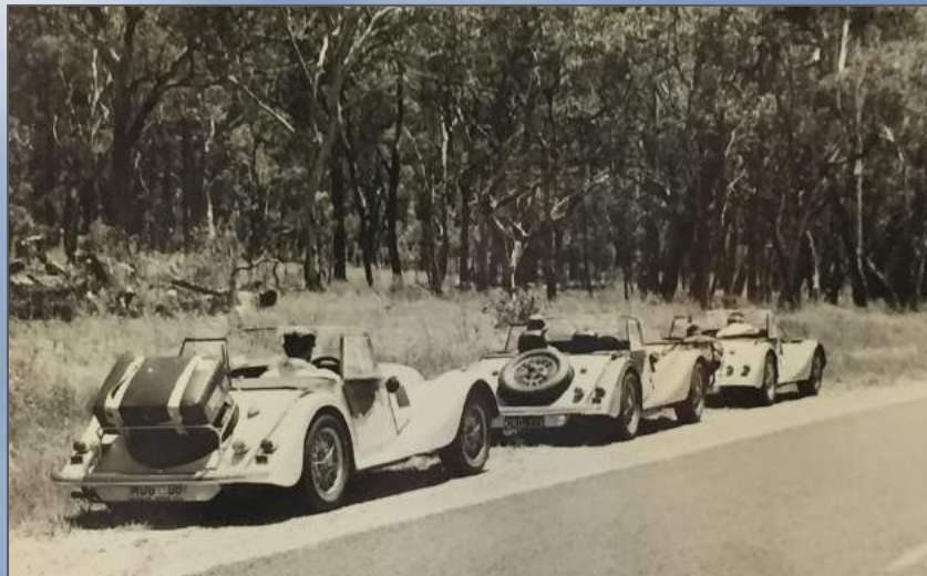
Three Brisbane +8s returning from a MOCA event in Sydney 1980; our member's car is the middle one.