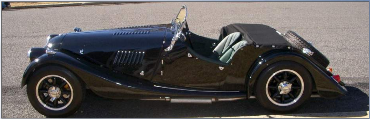
The second 4/4 restoration.

The photos used in this article are from the following sources: