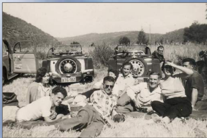
Picnic at Kangaroo Valley prior to establishing MOCA – both MOQ club members who are the subjects of Photo Series Nos. 1 & 3 are in the photo.