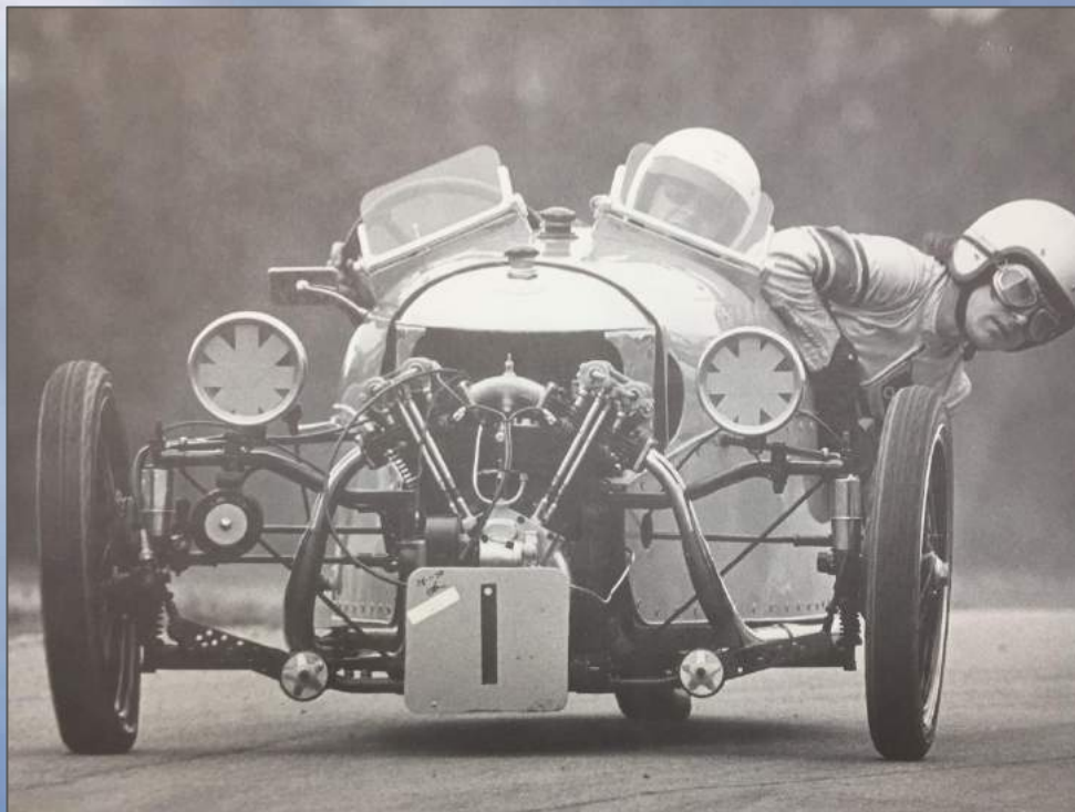
In action at Oran Park in 1978.