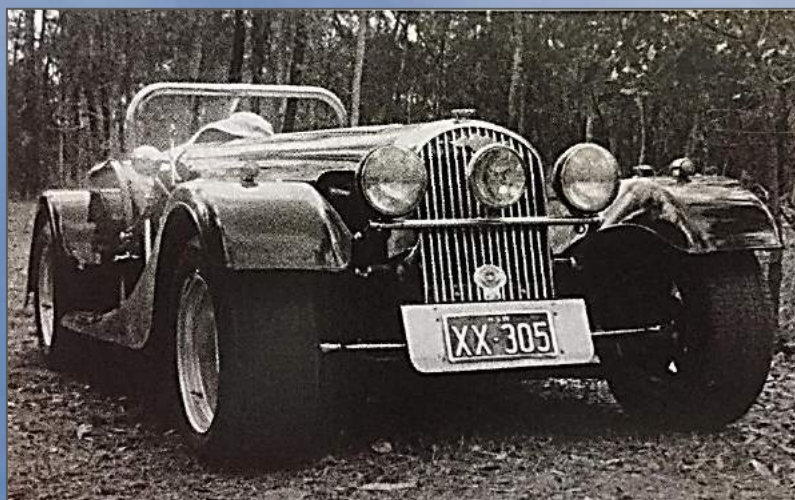
An awesome +4.

He also attended the first meeting of MOCA in July 1958.