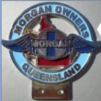
MOQ CAR BADGE