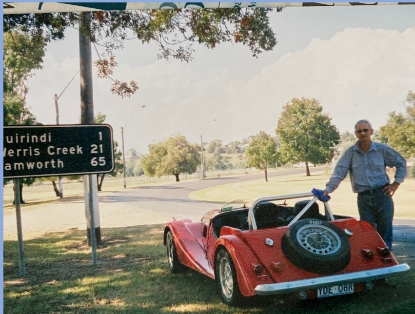
The 1986 Morgan Plus 8 in Targa trim (2005)

While the Plus 8, now suitably subdued, provides true classic sports car touring, I missed the unique rotary experience of the RX-7. In 2014, I purchased one of the last Mazda RX-8s.